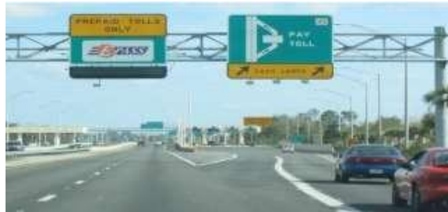
Picture 1. Highways in the United States.

Several toll roads built around the world have become famous thanks to their very long distances. One of the longest in the world is the Pan American Highway. The Pan American Highway runs from Alaska in the north of America through Mexico and ends in southern Chile and Argentina. No less than 15 countries, including Latin American countries, are traversed by toll roads whose total length reaches this 47,516 km. To optimize the toll payment system in the United States, use E-mail.