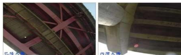
Picture 10. Photographs of Balin Bridge and Neiwan Bridge taken during UVA Autonomous Flight Inspection.

Module" allows bridge inspection personnel to use tablet computers to quickly and easily route flight routes. In addition, control of the UAV with autonomous flight in close proximity to the bridge will make it easier to take photos of the current condition of all parts of the bridge according to the requirements. to the specified route.