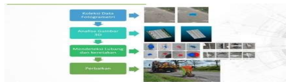
Picture 6. Road Inspection Method by UAV.

The Taiwanese government has saved time and money on road inspections with drone data. The team chief engineer in administration and field is responsible for flying the drone once or twice a week. Smaller projects only take 15 minutes, while larger ones can take some time up to two hours. When comparing this with traditional survey methods and UAVs, the time cut from traditional methods, using a road survey UAV covering approximately 5 km (3.1 miles) requires three UAV units, each lasting between 18 and 22 minutes. This adds up to about an hour of flight time. In flight at an altitude of 100-120 m (328- 394 ft) and using a government base station to correct for accuracy to about 2 cm (0.8 in) accuracy. The administration department primarily looks at the volume of damage and potholes with the tightest possible tracking across the entire project. One of the main ways drone accuracy proves to be cost-effective is its ability to help contractor work progress. The government hires contractors to build roads, with drone data, it's easier, faster and more accurate to compare estimated work to what's actually happening on the ground.