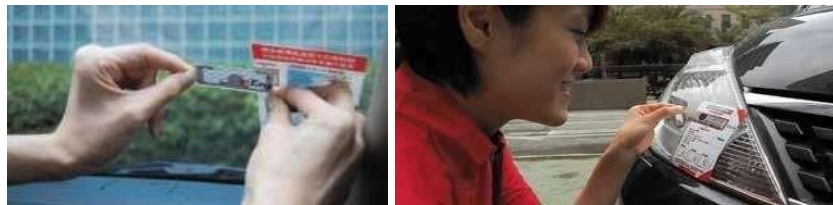
Picture 2. Installing e-Tags on Vehicles in Taiwan.

The toll gate divides the highway into segments, each of which has a price value determined by the distance to the next gate (intersection). The daily gate count is calculated at midnight, and the total cost is deducted within 48 hours. Each vehicle receives a further discount after the first 200 kilometers, and eTag customers with prepaid accounts get a further 10% reduction. Non-customers are billed with license plate recognition and mailing reports, or can make payment at the convenience store on the third day after the vehicle trip, because ETC subscription is not mandated by law.