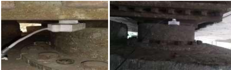
Picture 12. Sensor Under The Bridge.