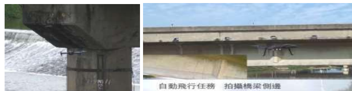
Picture 9. The Transportation Research Institute of the Ministry of Transport has developed an unmanned aerial vehicle (UAV) to replace manual inspection vehicles to inspect bridges.

With climate and environmental changes, bridges often age and deteriorate gradually over time requiring regular inspections and sufficient budget for repairs of these bridges.