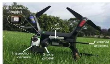
Picture 7. Inspection Camera.

conditions. . To provide real-time multimedia data, RTP can facilitate network delay differences and detection of non- consecutive data.