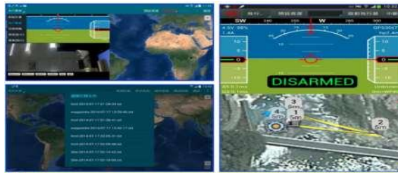
Picture 11. UAV Ground Control Program Operation Screen.

In addition to using UAVs for inspection, Taiwan has used BHMS (Bridge Health Monitoring System). Structural Health Monitoring enables rapid assessment of bridge health, and this approach is recognized as one of the best available means to improve general safety and optimize bridge operations and maintenance. The high cost of traditional HMS is a major challenge in transitioning traditional HMS techniques from R&D to field implementation to BHMS for the whole process.