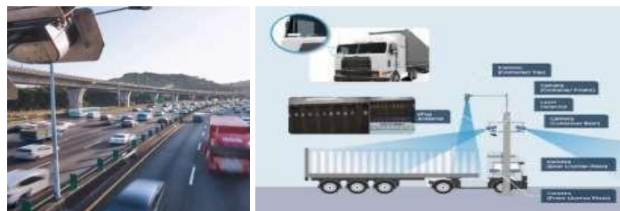
Picture 4. Radar and CCTV Working Mechanisms on Toll Roads.

so that customers feel satisfied and feel valued when providing services, besides that it is necessary to apply SOPs as standards in service delivery. especially in the field of Non-formal Education, as well as support and commitment from all apparatus at the Mamasa District Education and Culture Office and Non-formal Education partners regarding understanding and behavior that must be changed in m providing services and equipping infrastructure to support services in the field of non-formal education so that the services provided can be maximized and the information submitted by internal and external informants on services in the field of non-formal education in general can be said to be good, but there are still things that need to be improved and perfected by the work unit of the Mamasa District Education and Culture Office, especially in the field of Non-formal Education regarding the quality of services that will be provided to customers so that they feel satisfied and feel valued in receiving services.