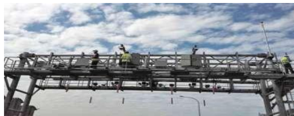
Picture 3. Installation of e-Tag Readers and CCTV Readers at Toll Gates in Taiwan.

The number of cars that have an eTag, an electronic tape attached to the windshield, already exceeds 6 million – equal to 94% of registered vehicles. Drivers whose cars are equipped with RFID eTag no longer have to slow down to pay tolls at the toll gantry. Instead, a total of 319 electronic gantries have used RFID (radio frequency identification) technology to track vehicle progress along the freeway, automatically.