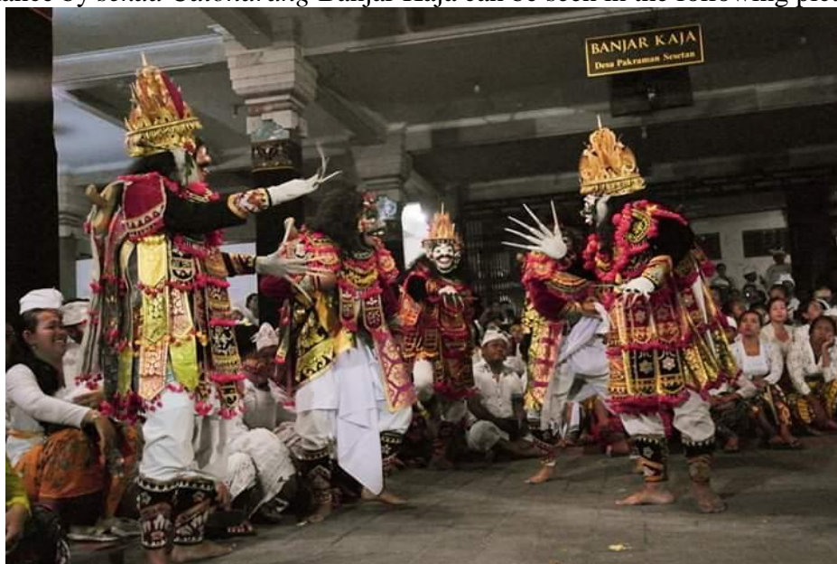
Figure 4 The Calonarang art performance which began with dancing Telek dance by sekaa Calonarang in Banjar Kaja

Interestingly, the art of Calonarang in Sesetan has been very lively nowadays and exists in every Banjar Adat , and is called sekaa sebunan . Whenever there is a Pujawali, they hold Ida Pelawatan dance with the theme of calonarang . They consist of several artists who are bound together in the Sekaa Calonarang unit, both male and female. They perform in earnest, because the opportunity to perform Ida Sesuhunan in the form of pelawatan is a gift that is highly expected. They believe that taksu blessings will flow to them, so that they will become Calonarang pragina metaksu . The Calonarang art performance by sekaa Calonarang Banjar Kaja can be seen in the following picture.