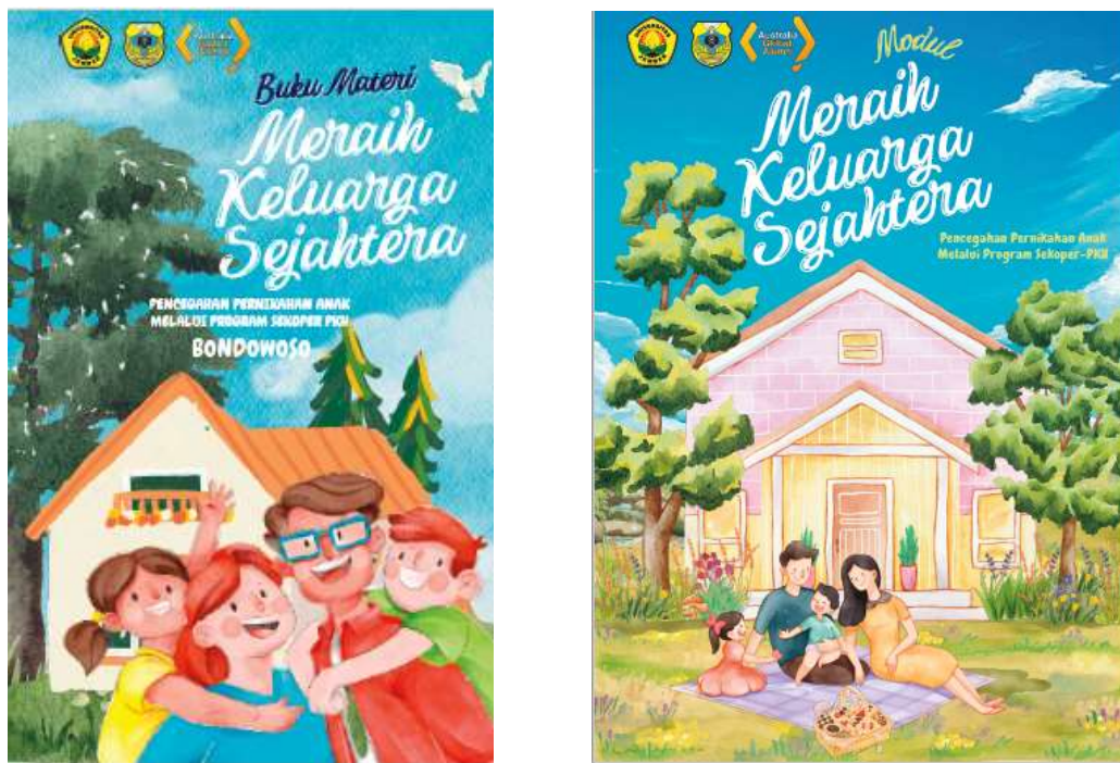
Figure 2 Reference book and Teaching Module SEKOPER PKH

There are two outputs of this activity, which is the reference book and teaching module. The teaching module contains (1) Function of the family, (2) Phase of Psychological and Reproductive development of Children, (3) Family management, (4) Impact of Child Marriage, (5) The Function of Marriage, and (6) Nutrition and Financial Management of a Family.