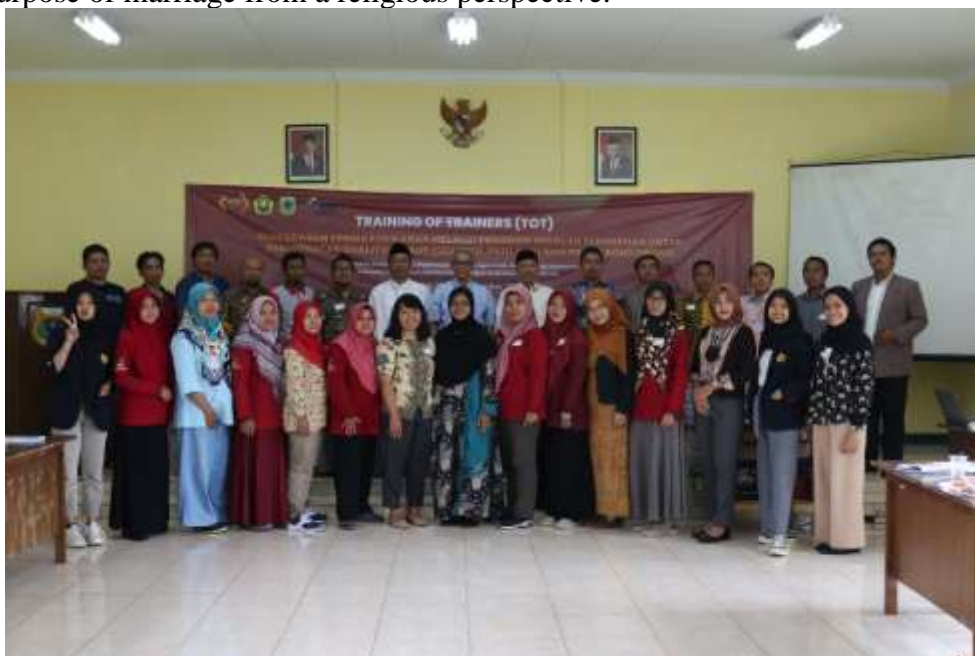
Figure 3 Training of Trainers SEKOPER PKH