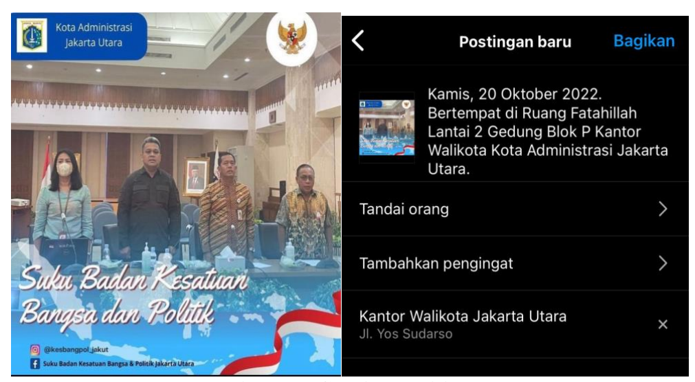
Figure 8. Caption Writing

"Thursday, October 20 2022. Located in the Fatahillah Room, 2nd floor, Block P Building, North Jakarta Administrative Mayor's Office. A webinar activity with the theme Implementation of Regional Government Partnerships with Political Parties has been carried out via zoom which was opened by the Head of the DKI Jakarta Provincial Kesbangpol Agency and the North Jakarta Kesbangpol Sub-Body Head."