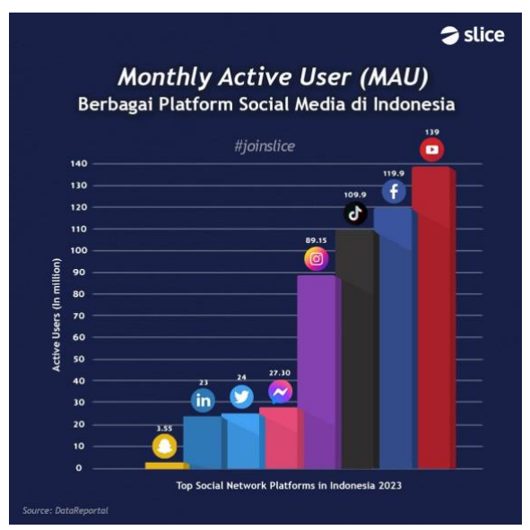
Figure 1. Graph of Active Social Media Users 2023