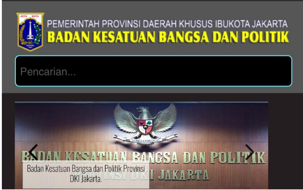
Figure 4. Website of National Unity and Politics

Websites are interconnected web pages which usually contain textual data, images, animations, audio and video content, etc., usually created for personal, organizational and commercial purposes (indowebsite.co.id, 2023). The North Jakarta City Government Political Unity and National Unity Agency website was added in 2012. This website is useful for viewing more detailed profiles such as background, main tasks and functions, vision and mission, organizational structure, strategic plans and work plans (bakesbangpol) (jakarta.go.id, 2012a).