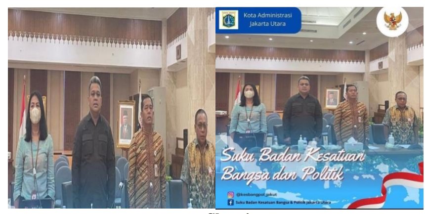
Figure 7. Shooting

The editing process is a process used to process and improve text, images, video or audio (Felderfans.com, 2023). In the photo and video editing stages, the North Jakarta Administrative City Politics and National Unity Agency uses the CANVA application. The editing that was done did not change the original image or photo too much. Content in the form of photos will be maximized for enlightenment and adapted to the templates provided. This template is useful for uniforming Instagram content for the National Unity Agency and Politics of the Administrative City of North Jakarta so that it looks neater, in the same color tone. Image or photo editing time usually only takes 15 minutes.