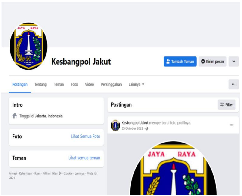
Figure 5. North Jakarta Administrative City Facebook