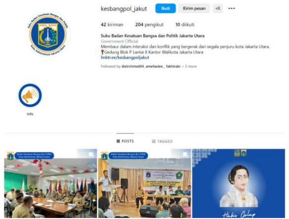
Figure 6. Instagram Subdivision of National Unity and Politics of North Jakarta Administrative City

Instagram is a photo and video sharing service from American Meta Platforms. The app allows users to upload media that can be edited with filters or organized by hashtags and geocodes (wikipedia.org, nd). The North Jakarta Administrative City Political Unity and National Unity Agency joined Instagram in 2019. However, at that time the use of Instagram was still not optimal due to a lack of administrators. Until then in 2022, Instagram will be active again with the aim of providing media to the public about the activities and activities of the North Jakarta Administrative City Political Unity and National Unity Tribes. In order to increase operations, the Instagram account and Instagram Facebook account of the Office of National Unity and Politics of the North Jakarta Administrative City have been merged. Every time you upload a post to Instagram, it will also be automatically uploaded to your Facebook account.