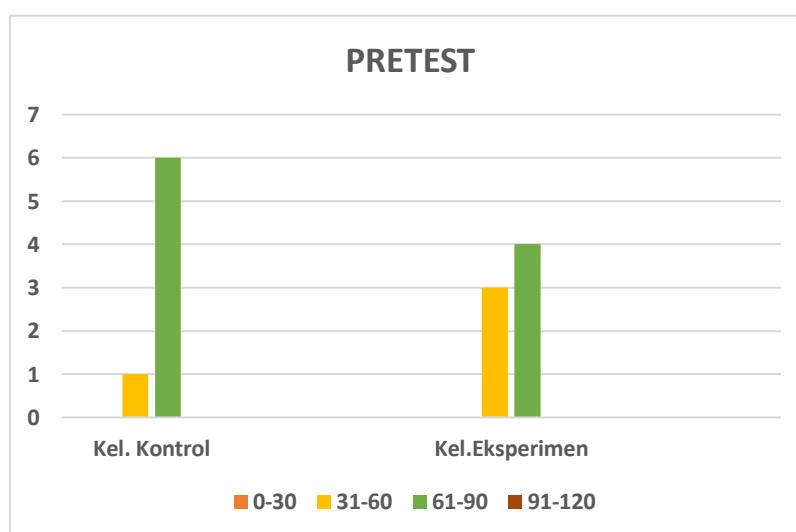
Figure 1. Social Adjustment Pretest Score Histogram among Experimental Group Learners

Based on Table 3, the amount of information is known to be 14 people, consisting of 7 students in the experimental group and 7 students in the control group. The mean or median value of the experimental group was 73.57 and the mean value of the control group was 66.71. The mean or median value of the experimental group was 75.00 and the mean or median value of the control group was 63.00. The standard deviation of the experimental group's information was 8.08. as well as the control group's standard deviation of 10.70. The minimum score of the experimental group was 60.00 and the minimum score of the control group was 52.00, the maximum score of the experimental group was 85.00 and the maximum score of the control group was 80.00. Based on Table 2, you can see the histogram of student tolerance test values in the experimental group and the control group shown in figure 1.