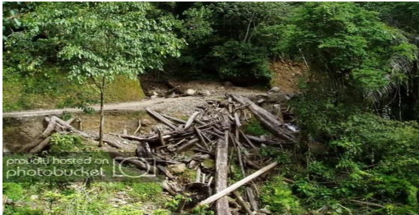
Figure 3. Tapan Road Segment – Sungai Penuh Not equipped Earth Retaining Wall.