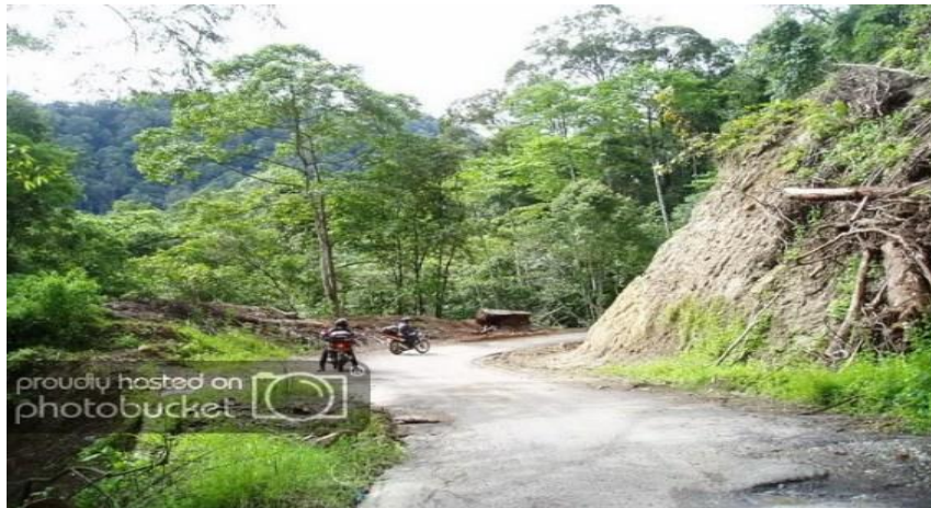
Figure 2. One of the Road Segments Tapan – Sungai Penuh with a Width of 5.5 m without Guardrails and Shoulders on the Left Right side is the Gorge and Cliff Wall

>. Road Body Width Requirements for National Arterial highways are at least 7 meters (2 lanes), while conditions in the field are 6 meters as can be seen in Figure 2.