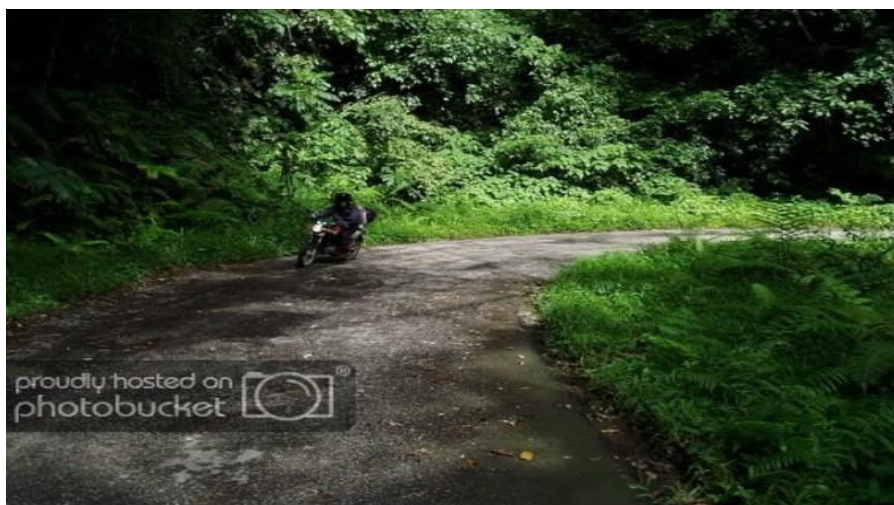
Figure 4. Road Section Bend Segments Tapan – Sungai Penuh without Equipped with Warning Signs Bends and Road Markings.

According to Law no. 38 of 2004 concerning roads, road equipment is in the form of traffic control signs in the form of signboards enforced by poles, traffic lights or in the form of road markings above the surface. Observing the condition of the existing road sections, they are also not equipped with warning signs and road markings as can be seen in Figure 4.