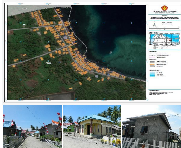
Figure 4 : Adaptation to changes in the residential settlements (Source : google earth, Februari 14, 2023; RPI, 2023, field data, July 2023)

This is done because residential environments are very vulnerable to natural disasters, namely waves, storms, strong winds, rain, which always hit settlements (Katayama R et al., 2000; Wiarto, Giri, 2017; Prayitno, G., etc., 2018; Rahmawati TA. et al., 2018; Mulyati, A., 2020). Residential buildings and environmental facilities use non- wood building materials (blocks, bricks, concrete, zinc, etc.), in the form of non-stilt houses. They no longer live entirely as fishermen who depend on marine products for their living, but open sales businesses, or become civil servants (PNS). Cultural life is maintained as the Bajo tribe always lives in coastal areas, harmoniously, in a family or community.