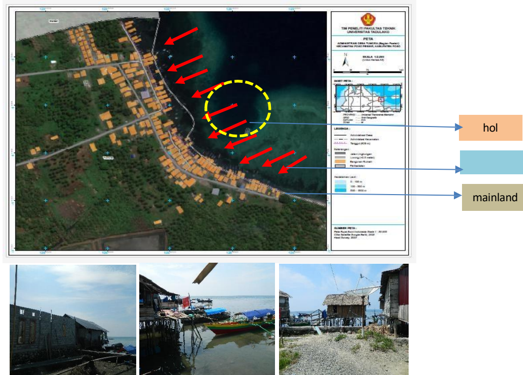
Figure 3 : Characteristics of Bajo Tribal Settlements

Settlements form curved lines in the direction of the coastline, residential buildings are not in the direction of the wind so the openings are made small, usually only in the form of doors. The linear curved pattern is characteristic, facing the sea as the center of orientation, connected by wooden bridges as a link between houses or between land and settlements. This space is also a space for interaction between settlers.