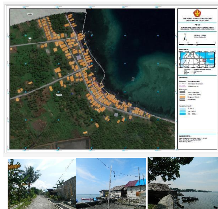
Figure 2 : Settlement of the Bajo Tribe, Tumora Village, Poso Pesisir District

They continue to occupy coastal land and build houses above the tidal level. Spaces that occupy water are oriented towards the sea as the main space, while spaces located on land are oriented towards environmental roads (Mulyati, A., 2013; 2014; 2015; 2018). Residential houses use pillars placed on the ground (tidal), still using wood as the main construction (poles or columns) and planks as wall coverings. The residence is completely above the water, connected by a wooden bridge from the land to the front of the residence.