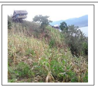
Figure 4. Hut (Sou) in Topo Da'a Lekatu Farmyard